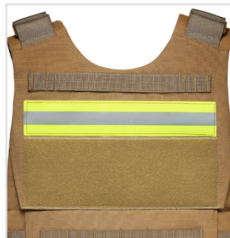
REAR DRAG STRAP