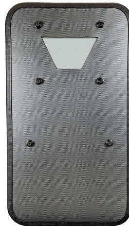
LEVEL III BALLISTIC SHIELD