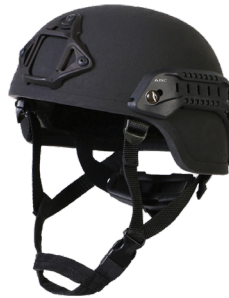
LEVEL IIIA ACH HELMET