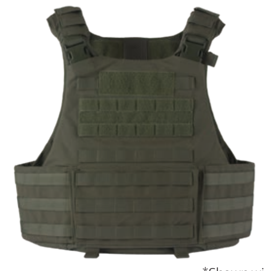
*Shown with cummerbund

Part of the Atlas Tactical Series, the Atlas T7 Full Coverage Tactical Vest is designed for operators that require lightweight protective coverage and high-speed mobility. Engineered as a scalable ballistic platform with optional quick release functionality and a range of accessories that are compatible with all Atlas series vests. The Atlas T7 offers a low-profile solution that is fully customizable with soft and hard armor inserts for mission-specific adaptability.